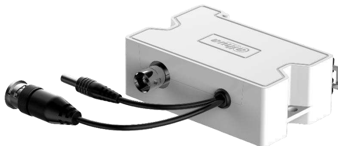
DH-PFM811-C PD End (Power device)