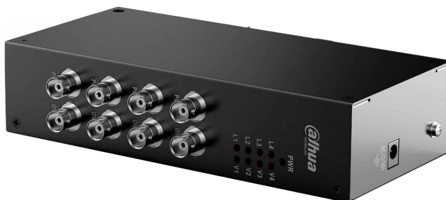
DH-PFM811-4CH PSE End (Power sourcing equipment)